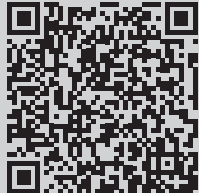
AGRU XXL Piping System Technical Handbook