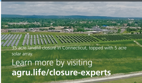
35 acre landfill closure in Connecticut, topped with 5 acre solar array.

Learn more by visiting agru.life/closure-experts