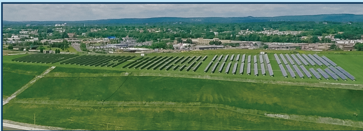
35 acre landfill closure in Connecticut, topped with five acre solar array.

AgruAmerica.com Chris Eichelberger ceichelberger@agruamerica.com 330-606-8970 • 800-373-2478