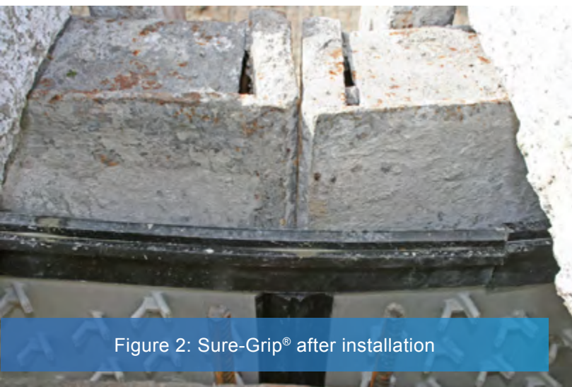
Figure 2: Sure-Grip® after installation

Several other companies were observing the performance and, as a result, we began additional projects in 2007. The project also resulted in Sure-Grip® liner installations at two large fish farming companies in the region of Lofoten that were installed by in-situ construction in 2008.