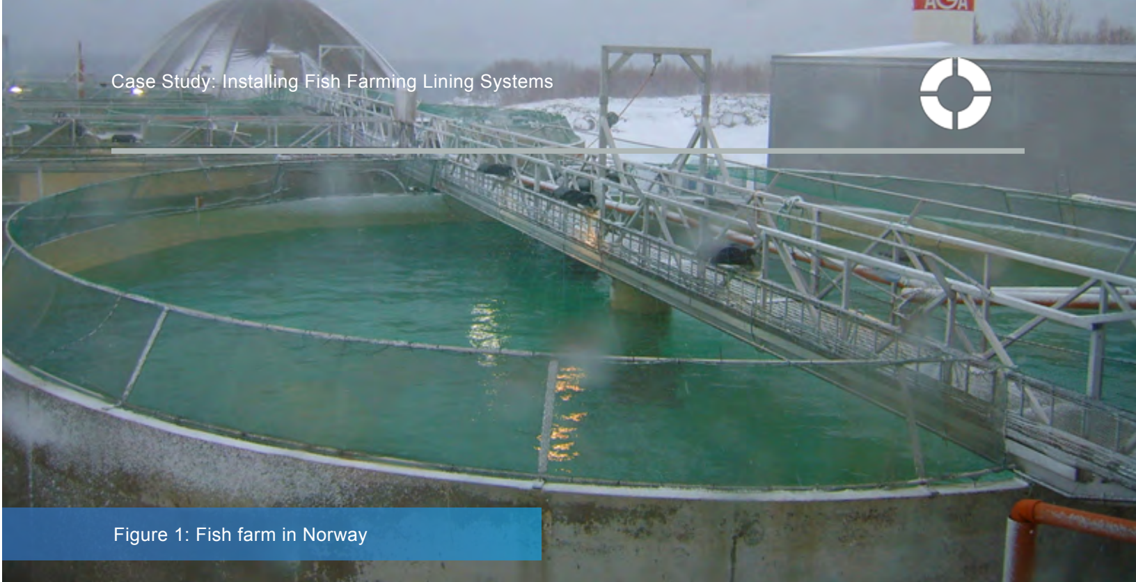
Figure 1: Fish farm in Norway