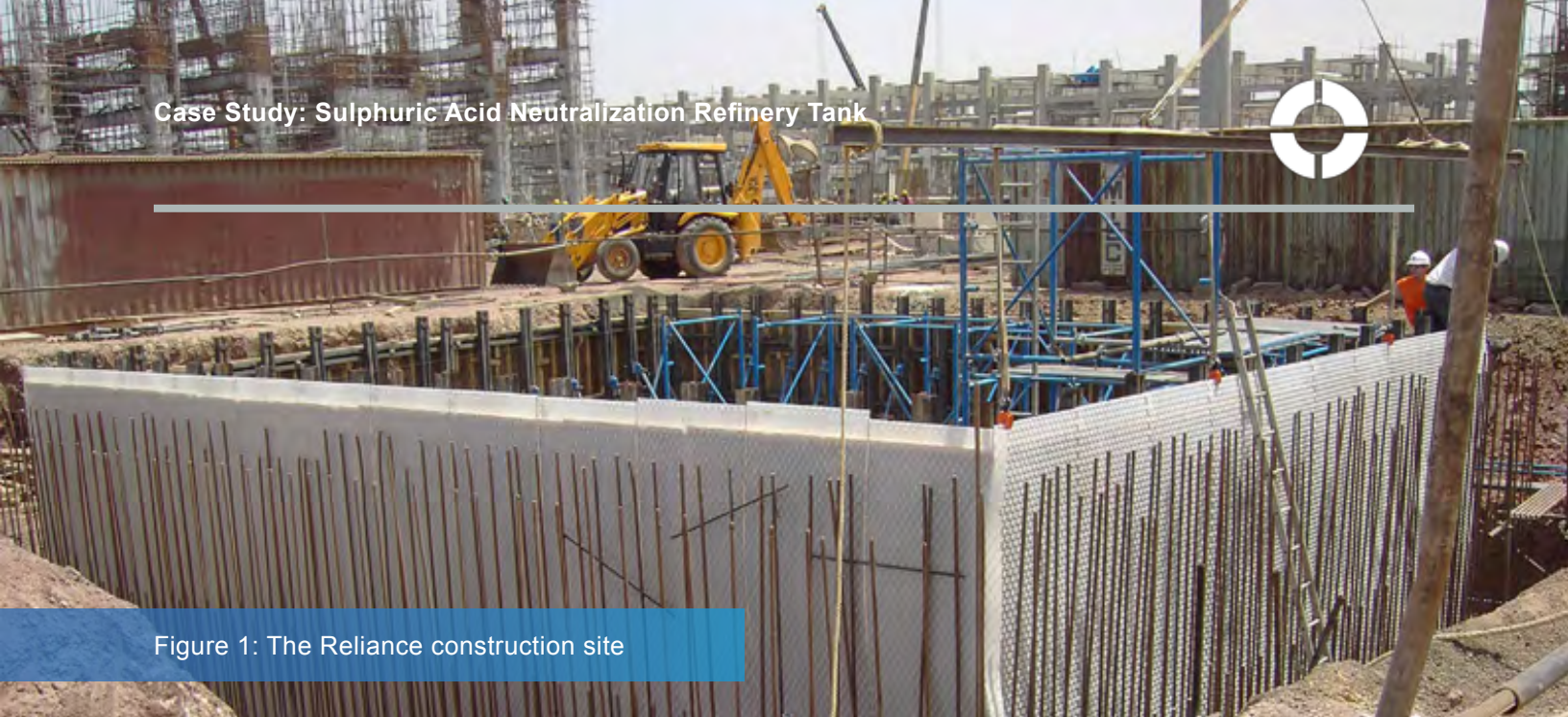
Figure 1: The Reliance construction site