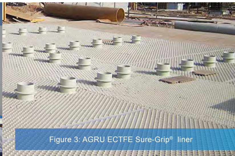
Figure 3: AGRU ECTFE Sure-Grip® liner