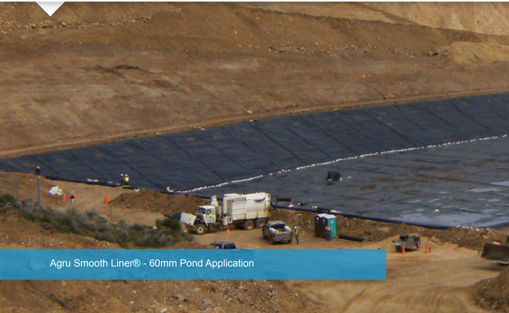
Agru Smooth Liner® - 60mm Pond Application

HDPE and LLDPE Agru Smooth Liner® meets or exceeds GRI GM13/17 test values, frequency of testing and test methods and requirements established by the environmental waste containment and civil engineering communities.