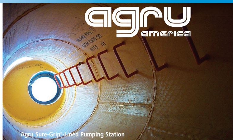
Agru Sure-Grip® Lined Pumping Station