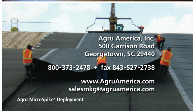
Agru MicroSpike® Deployment