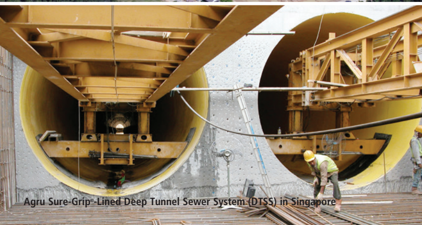
Agru Sure-Grip® Lined Deep Tunnel Sewer System (DTSS) in Singapore