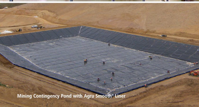
Mining Contingency Pond with Agru Smooth® Liner