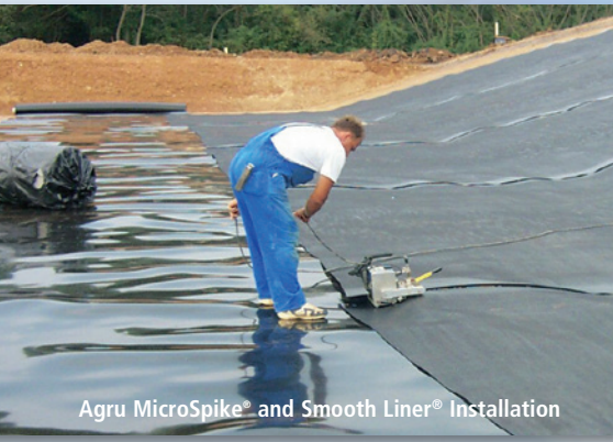
Agru MicroSpike® and Smooth Liner® Installation