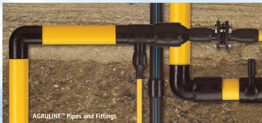
AGRULINE™ Pipes and Fittings

Piping systems for sanitary applications, compressed air, potable water supply, sanitary facilities and for industrial applications.