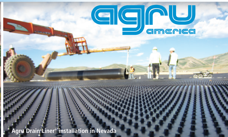
Agru Drain'Liner® installation in Nevada