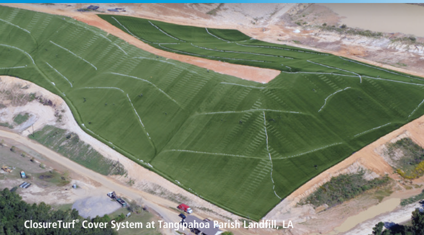
ClosureTurf® Cover System at Tangipahoa Parish Landfill, LA