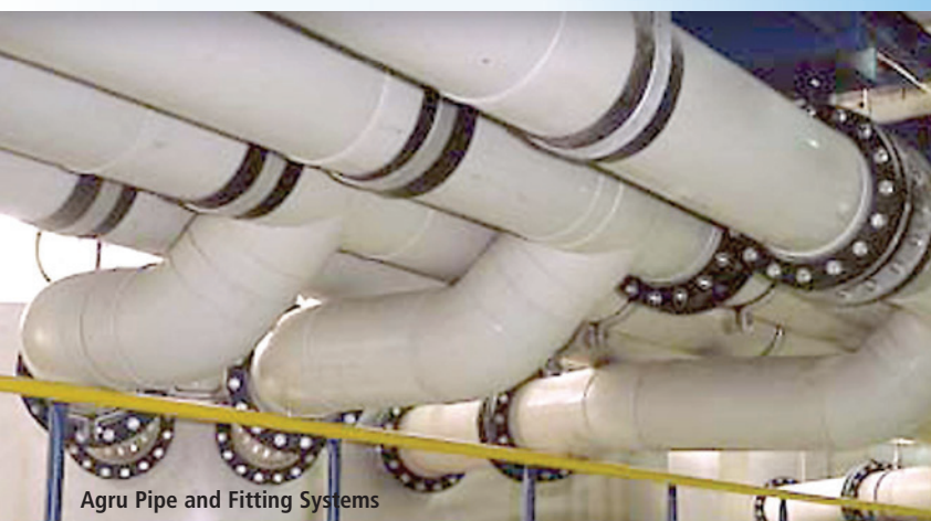
Agru Pipe and Fitting Systems