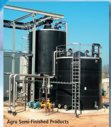
Agru Semi-Finished Products

Sheets, round bars and welding rods made of premium resins for tank or other construction.