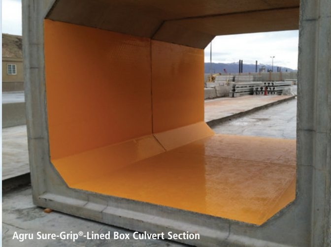
Agru Sure-Grip®-Lined Box Culvert Section