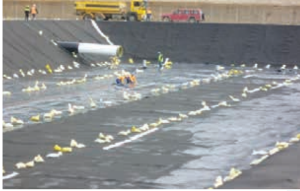
Fiberglass Pipe OD 900mm