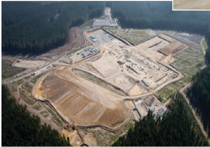
Ngatamariki Power Station in New Zealand