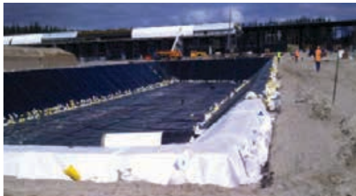
Primary Layer: AGRU HDPE Liner with nonwoven Geotextile 300g underneath

The Solution: Agru, for many years, has created High Temperature Resistant (HTR) polyethylene piping for hot water applications. With this vast knowledge and experience, Agru developed the first known HTR HDPE geomembrane in the marketplace.